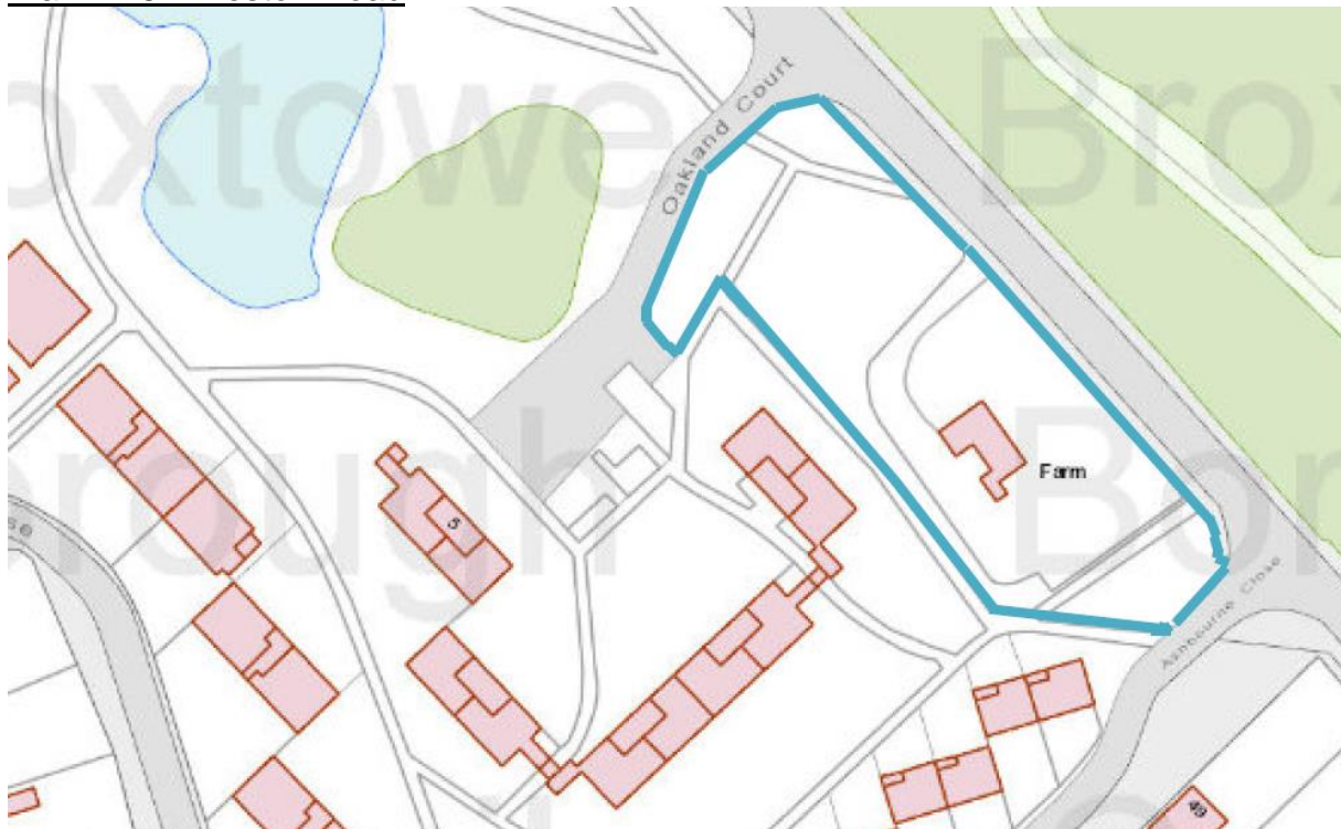
Plan 2 - 51 Ilkeston Road